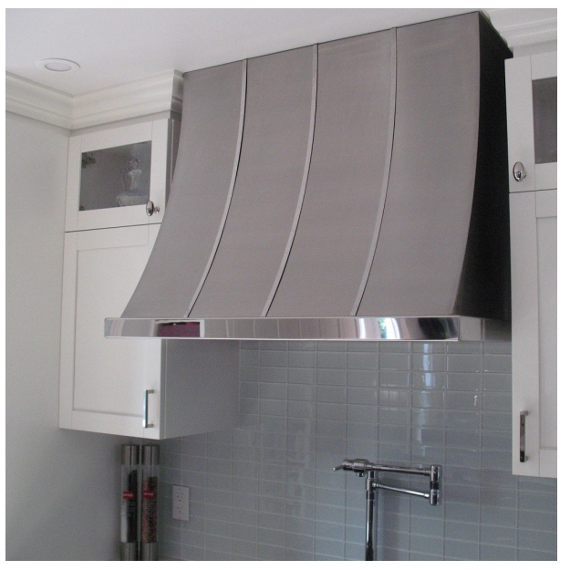
Our customized ventilators/exhaust hoods are built with heavy-duty fan and light assemblies, so they don't just look great, they work great, too.