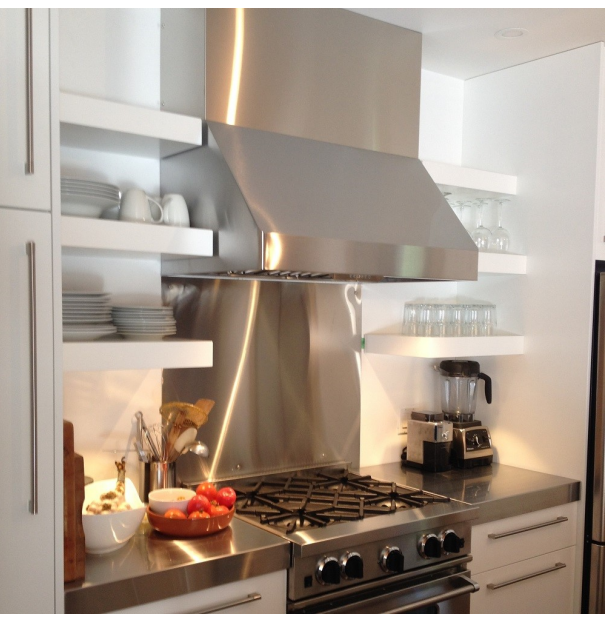
Add a stainless steel backsplash and stainless steel counters for the ultimate cooking space!