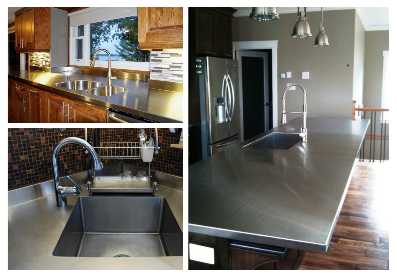
Several countertop profiles are available

Stainless steel counters can be any shape you want and can easily accommodate a seamless integral sink of any shape as well. The seamless design makes cleanup a breeze and helps keep your kitchen healthy!