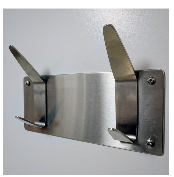
Coat/Towel Racks (available in 2, 3, 4, or 6-prong)