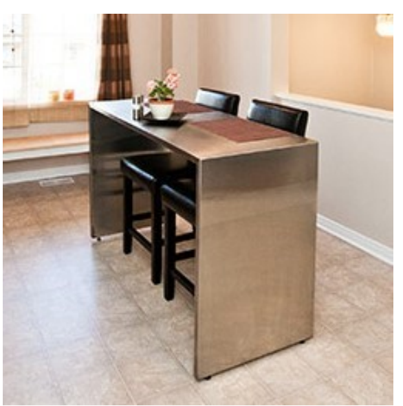
Custom furniture and Kitchen Islands